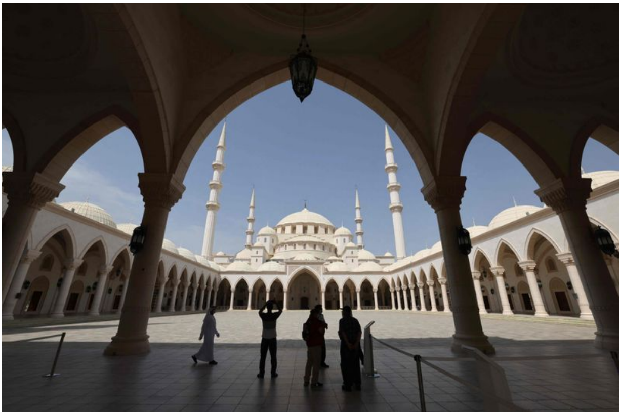
Visitors at the Sheikh Zayed Mosque in Fujairah.