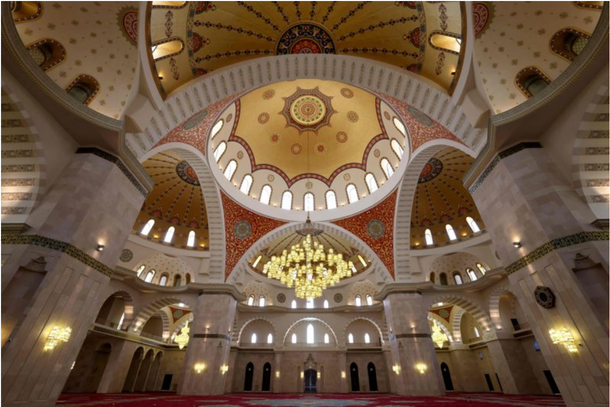
The interior of Sheikh Zayed Mosque in Fujairah. The entire mosque features beautiful chandeliers imported from Egypt.