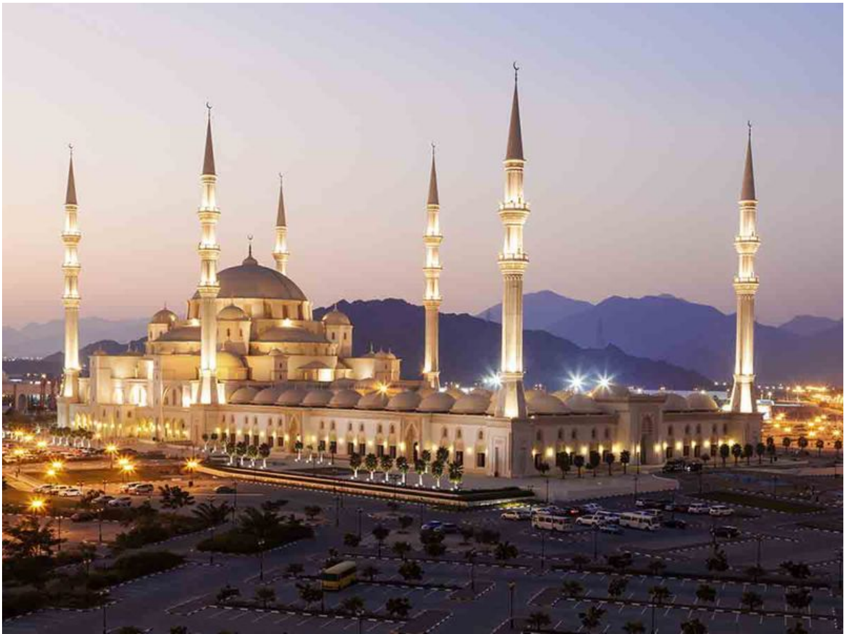
Sheikh Zayed Grand Mosque in Fujairah illuminated at night. The mosque opened in 2015, and Fujairah's ruler, Sheikh Hamad bin Mohammed Al Sharqi, led the first Eid prayers.