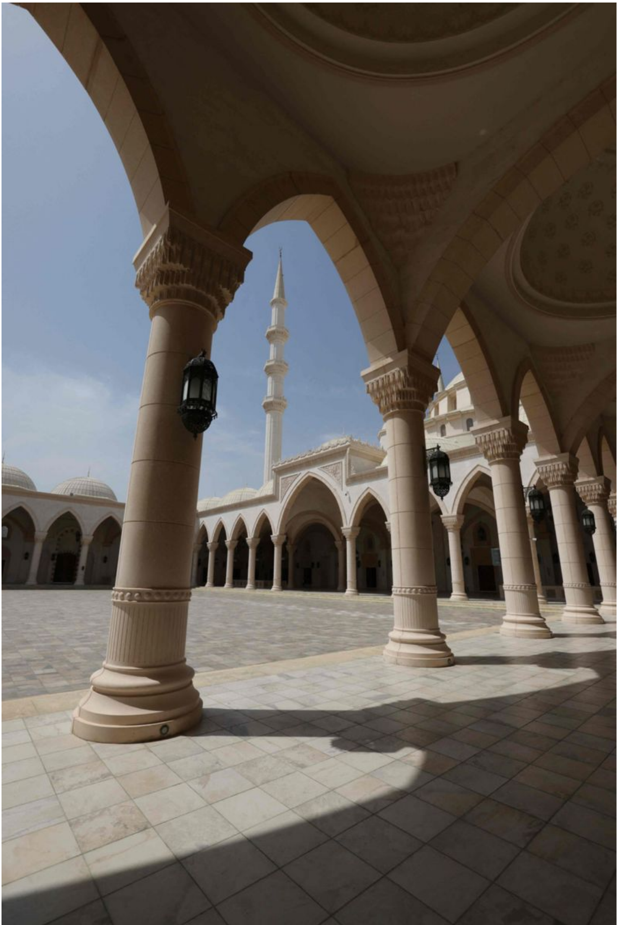
The courtyard of the mosque, with fountains and gardens, can hold 14,000 people.