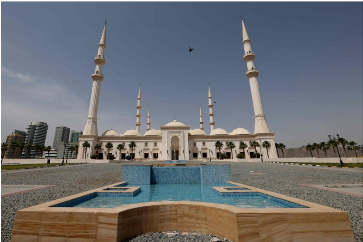
Sheikh Zayed Mosque in Fujairah, is similar to the Blue Mosque in Istanbul and has 65 domes and six minarets.